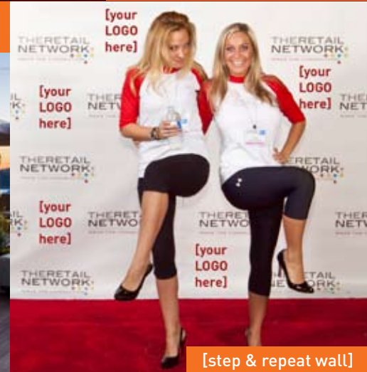
[step & repeat wall]