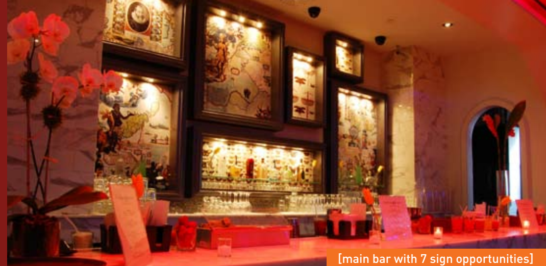
[main bar with 7 sign opportunities]