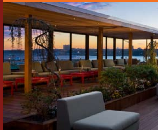
[rooftop garden lounge with logo projection for anchor sponsor on adjacent building]