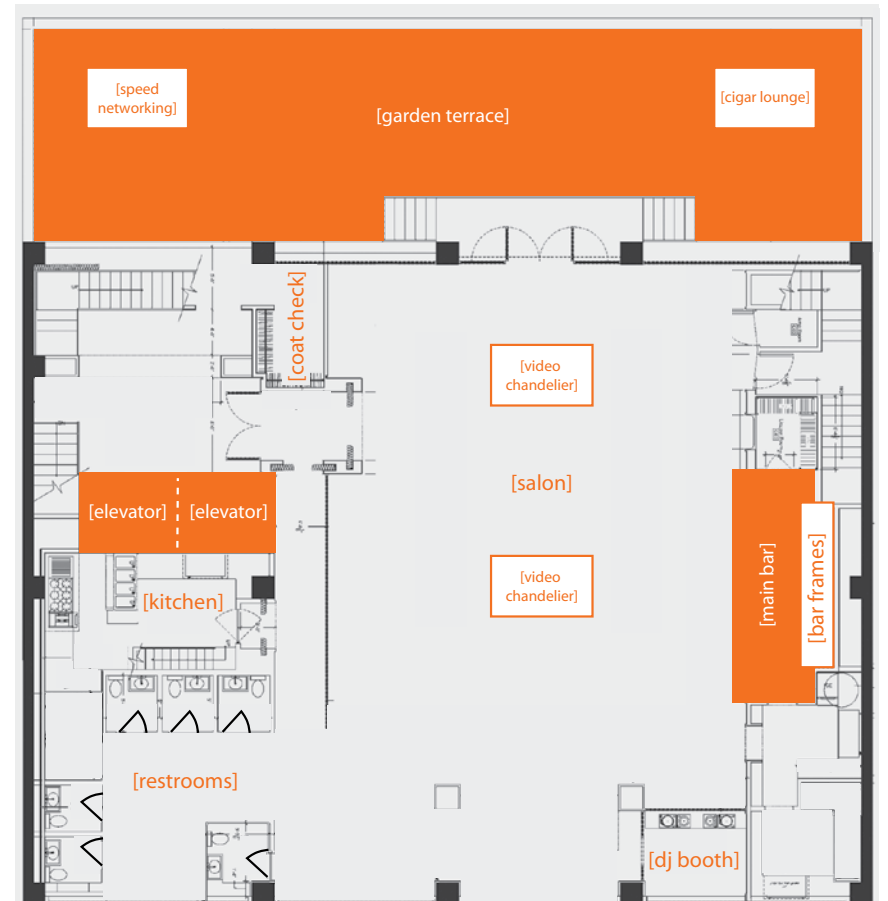
the salon and garden terrace